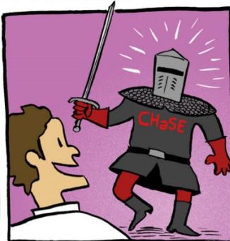
"Worry not confused scientist" shouts Sir CHaSE. the knight of career guidance and defeater of the beast.