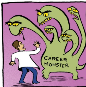
The confused scientist is suddenly faced with the perilous career monster! "FSSSSSSS!" hisses the monster.